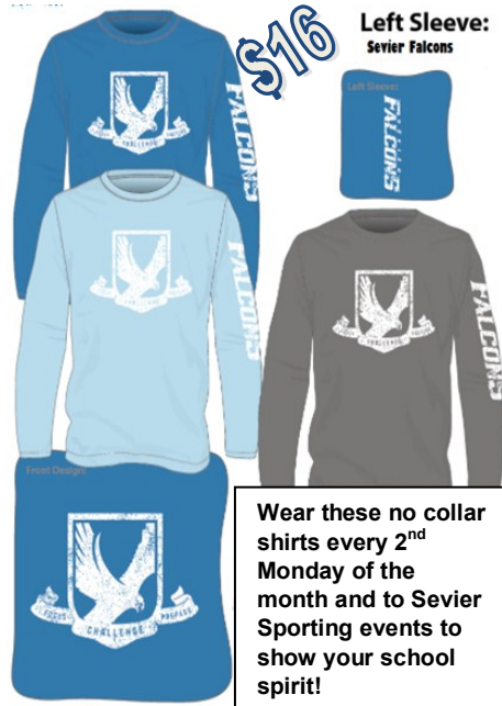
Left Sleeve: Sevier Falcons

Wear these no collar shirts every 2 nd Monday of the month and to Sevier Sporting events to show your school spirit!