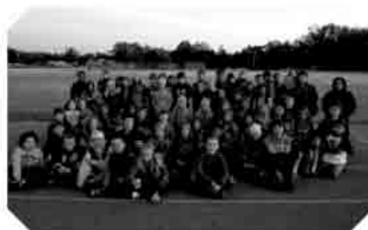
2011 Walking Club