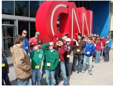
Sixth grade students in Atlanta in February.